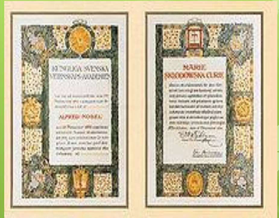
1903 Nobel Prize Diploma.