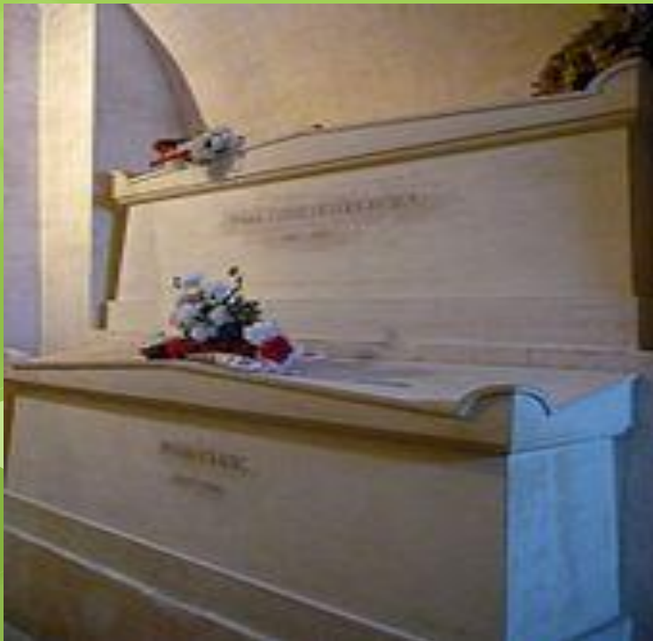
The tomb of Pierre and Marie Curie.

She died in 4 th July 1934, aged 66 at a sanatorium in Sancellemoz, France due to aplastic anaemia brought on by exposure to radiation while she was carrying test tubes of radium in her pockets during research.