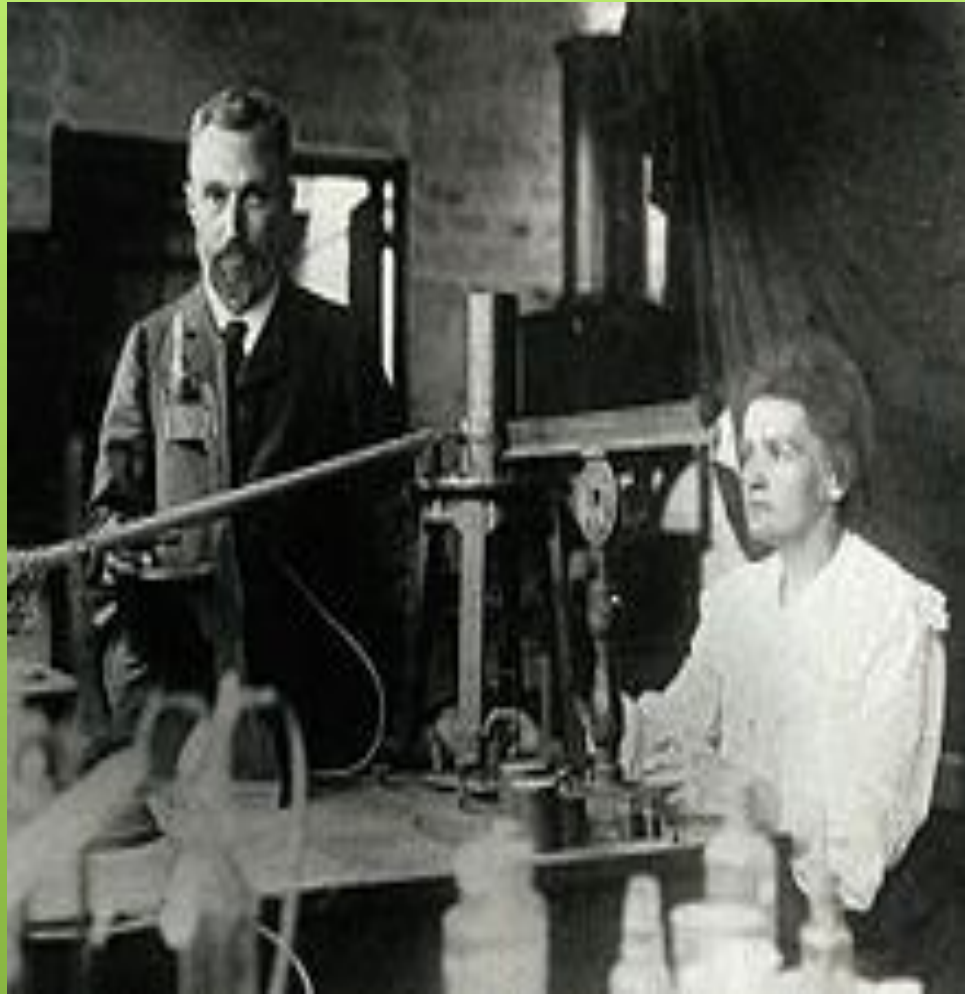
In the Laboratory